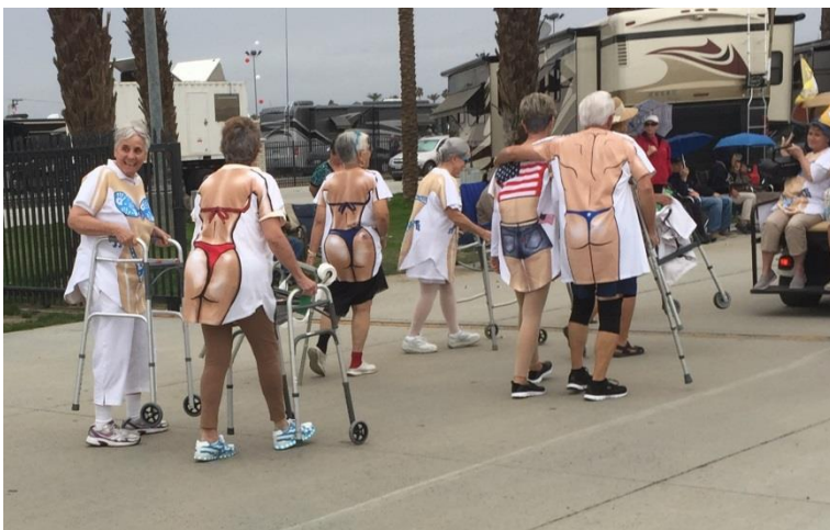
"At the Beach" rally parade, Indio, CA. Jan, 2017